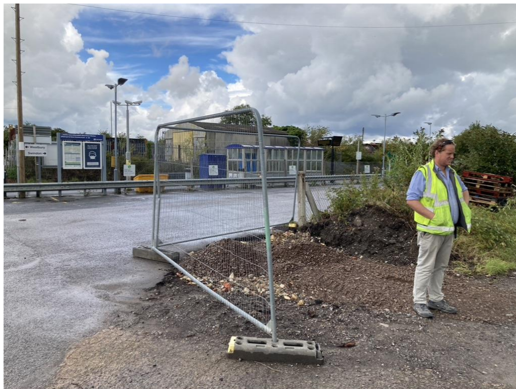
Pedestrian island to platform crossing