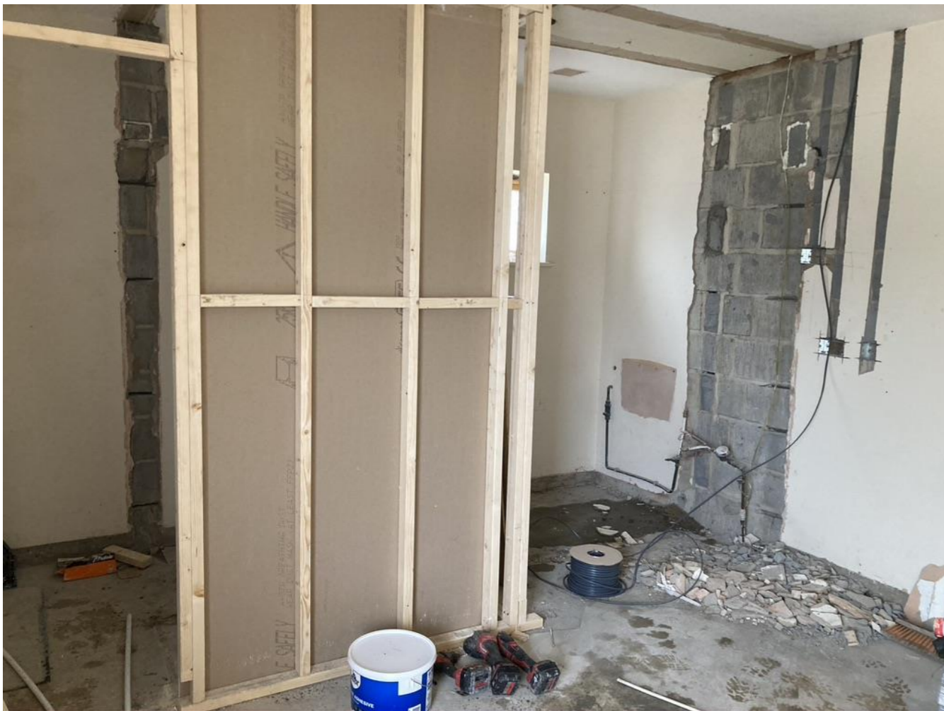
Current - Café interior work commenced