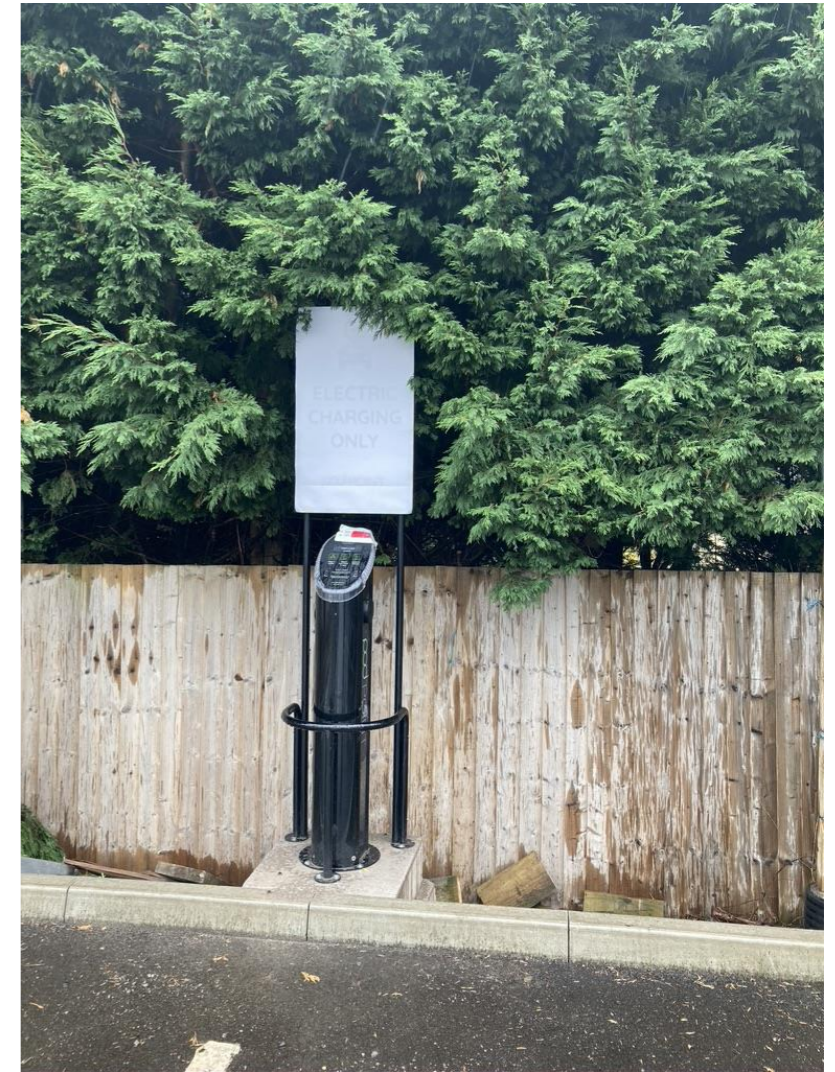
Electric Vehicle Charging (waiting commissioning)