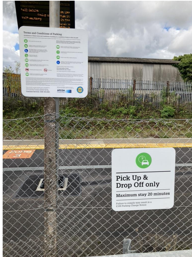
GWR Platform Parking - 20 minute stay maximum