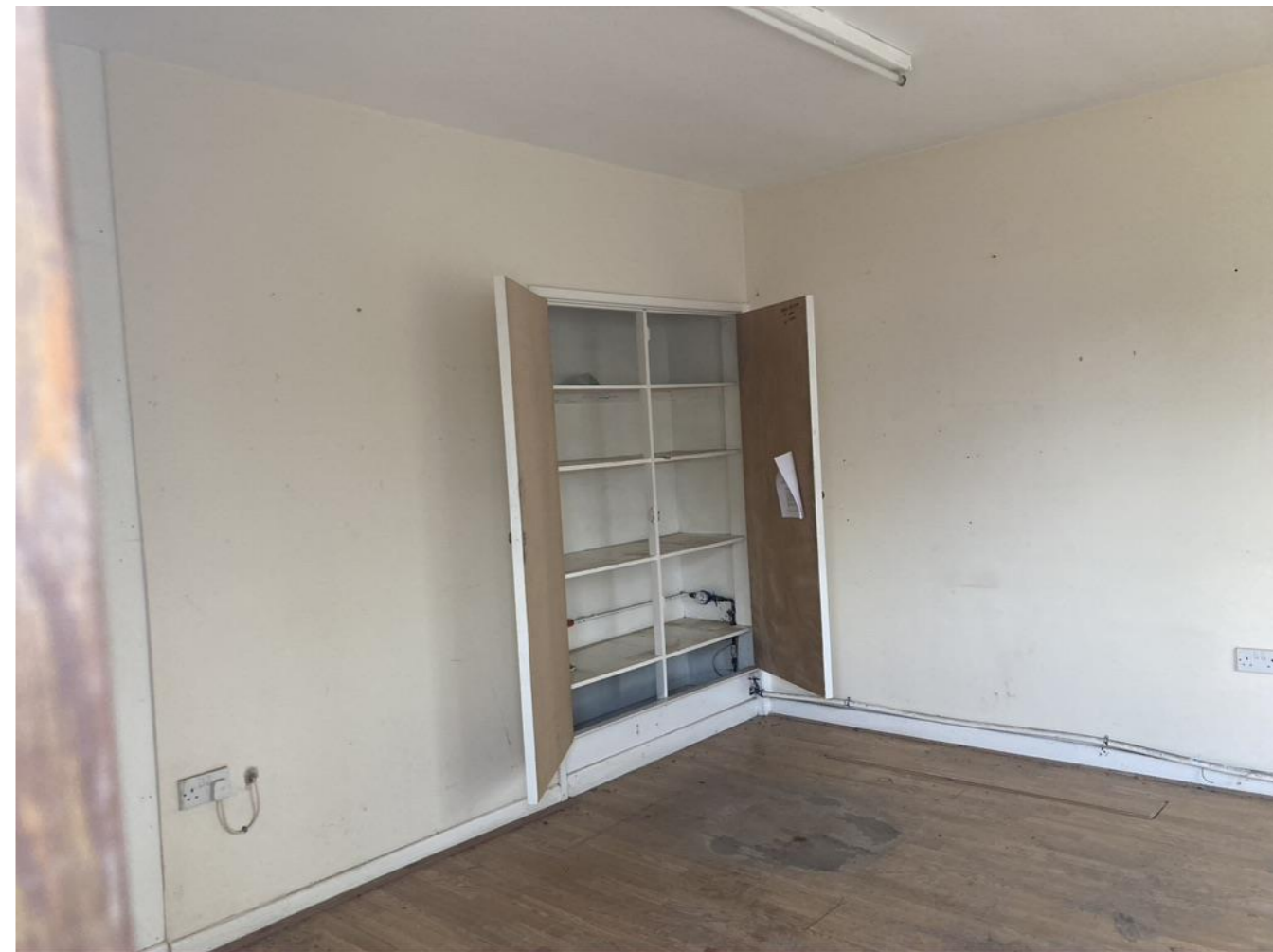
Before - original hut interior